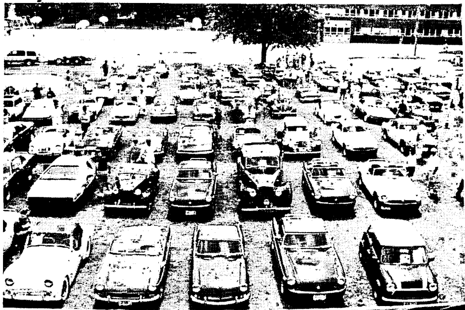
DAVE WINTZ'S BRIT DAY AT MANKATO WAS A HUGE SUCCESS WITH NEARLY 140 BRIT CARS