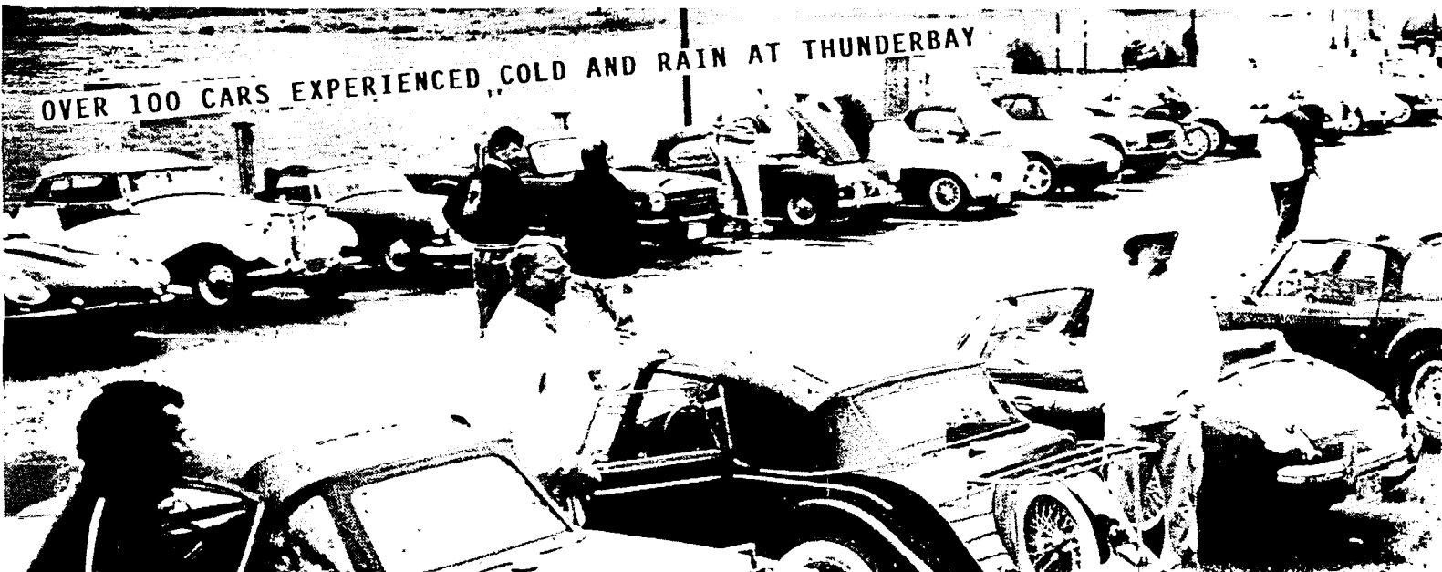
OVER 100 CARS EXPERIENCED COLD AND RAIN AT THUNDERBAY