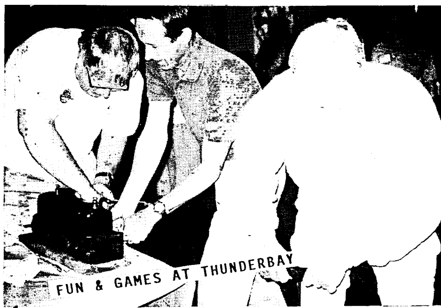
FUN & GAMES AT THUNDERBAY