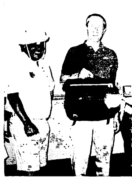
THUNDERBAY DOOR PRIZ