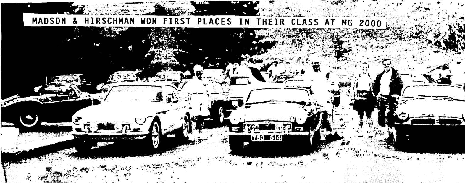
MINNESOTA CARS AT MG 2000 IN CLEVELAND+HENLE+MADSON+SHIDLA+HIRSCHMAN