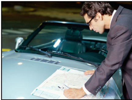
Top Even Healeys are invited! Bottom No need to feel lost, we'll all be sticking tightly together

down some of the best hills and curves to be found anywhere. After about a drive of 1 hour, we will be stopping for a break. Then it's on to the best part of the trip where we will explore the bluff country of southern Minnesota. We will end up at the Fisherman's Inn in Oronoco for a late lunch at about 2:00 PM. After lunch, there are several antique stores in the area to explore if you feel the need for junk.