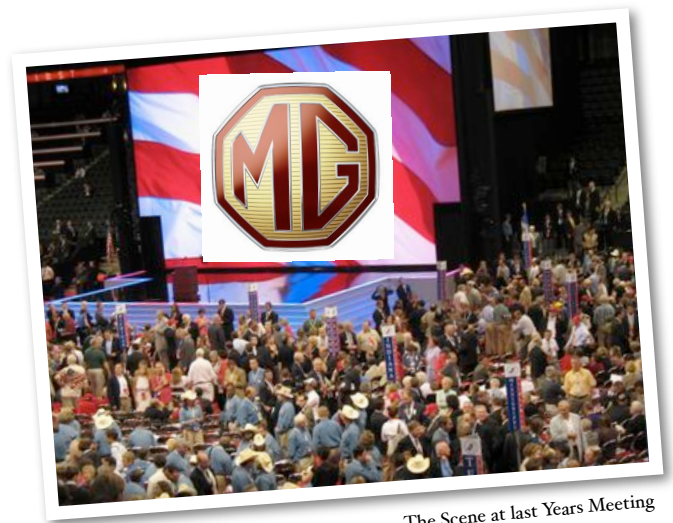
The Scene at last Years Meeting

We are filling several positions this year and look forward to your participation.