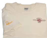
Short Sleeve T-Shirts $15.00 each