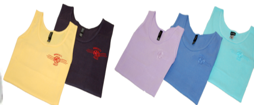
MMGG Tank Tops $12.50 each