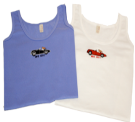
MG Girl Tank Top $12.50 each

To place orders contact: Cindy O'Brien randycindyo@earthlink.net