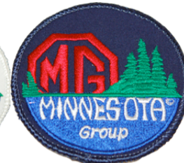
MG Patches $14.00 each

There are many more options of clothing not shown here when ordering MMGG Regalia. Ask Cindy if you want to see the various styles of: