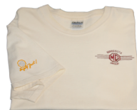
Short Sleeve T-Shirts $15.00 each