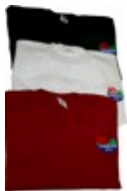
MMGG Sweatshirts $27.00 each