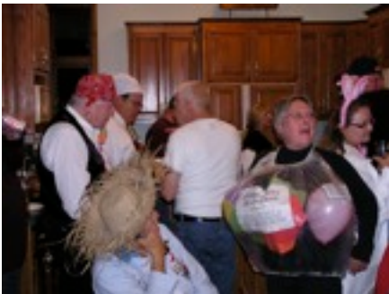
The Miracle of Birth - Rabbit arrived pregnant - Billy Bob's mail order bride left pregnant !