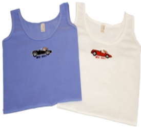
MG Girl Tank Top $12.50 each

To place orders contact: Cindy O'Brien randycindyo@earthlink.net