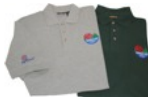
MMGG POLO SHIRTS $24.00 each