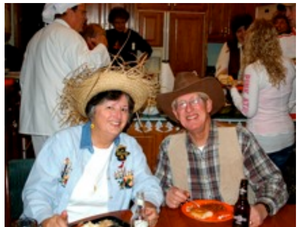
Ab ! What is it about cowboys & beans