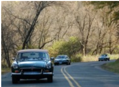
The Tour !