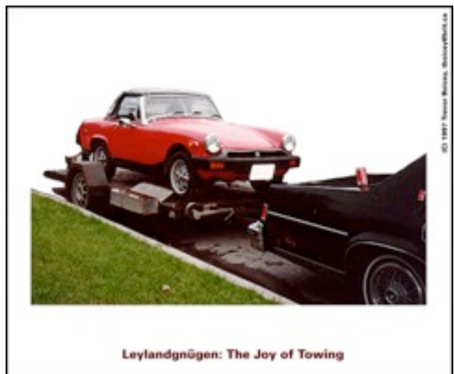
Leylandgnügen: The Joy of Towing