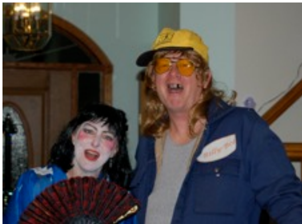
Another match made at the airport!