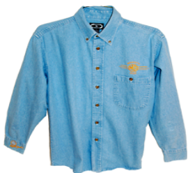
MMGG Denim Shirts (Short and Long Sleeve) $30.00 each