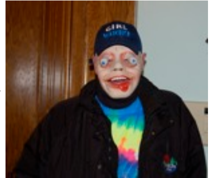
The reason a lot of people keep their children safe at home on Halloween !