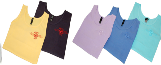
MMGG Tank Tops $12.50 each