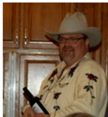
A cowboy & wine! Must be saving the whiskey for his horses!