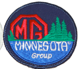
MG Patches $14.00 each

There are many more options of clothing not shown here when ordering MMGG Regalia. Ask Cindy if you want to see the various styles of: