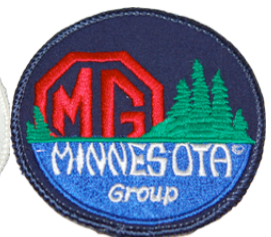
MG Patches $14.00 each

There are many more options of clothing not shown here when ordering MMGG Regalia. Ask Cindy if you want to see the various styles of: