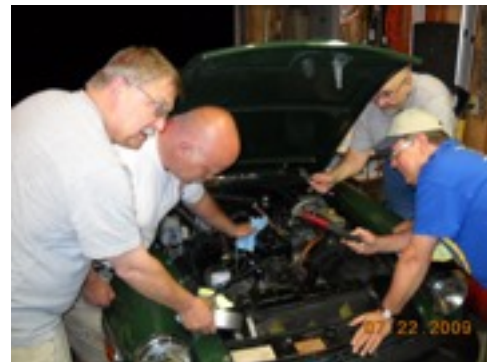
And speaking of 'clubs' - do not hire these guys to do the work!